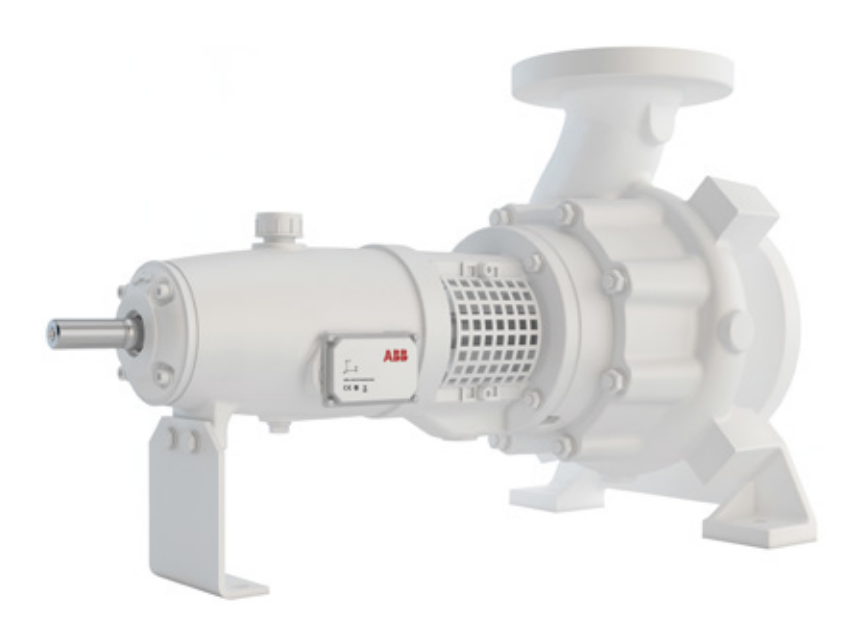
ABB Ability™ Smart Sensor Condition monitoring for pumps

The ABB Ability<sup>™</sup> Smart Sensor converts traditional pumps into smart, wirelessly connected devices. It enables you to monitor the health of your pumps, identify inefficiencies and improve reliability and safety.